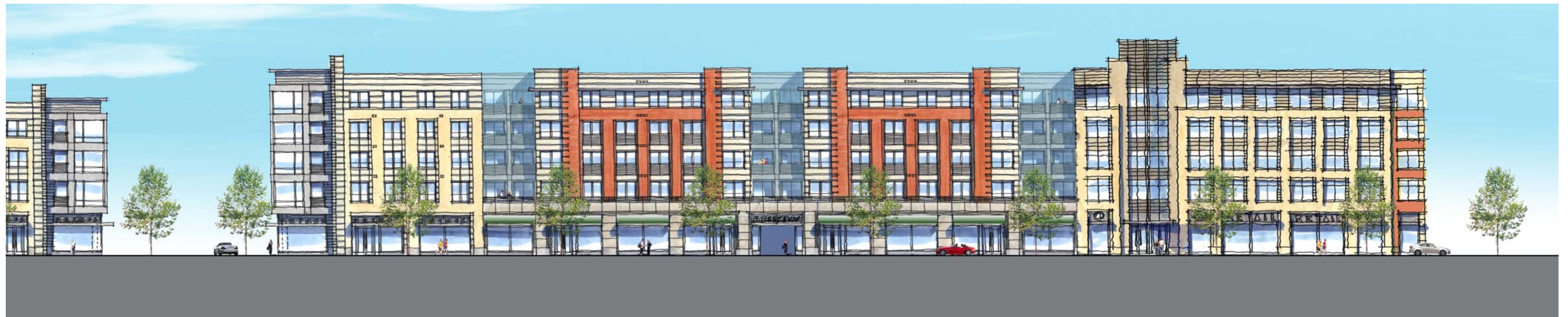
1 BLDG #2 PERSHING DRIVE ELEVATION